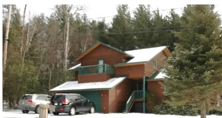
LAKE PLACID MOUNTAIN HOME – 2021 FUNDRAISER QUAKERTOWN BPW

This year, our large fundraiser will be a drawing for a getaway at a mountain home in Lake Placid, NY. Proceeds will benefit our scholarships and community donations. We also have planned projects for our Veterans, collections for Laurel House and Girls on the Run Organization, our State Project.