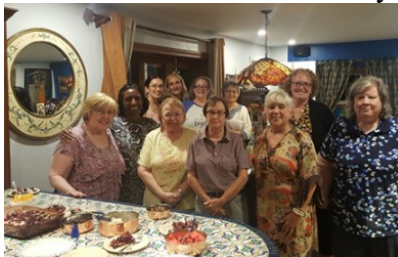
CMC BPW Planning Meeting Members

Central Montgomery County BPW got off to a great start with a planning meeting with our many members back in July. Issues Management was on the agenda as all the monthly meetings were given themes and program speakers. We are providing our BPW/PA's project, "Girls On The Run," the month of March and the month of May to be our big celebration for our 95 th Birthday!