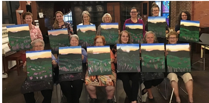
Several of our members and a few guests joined together at the Warehouse Theatre Gallery in Wellsboro for a "Wine & Design" Party! What fun!