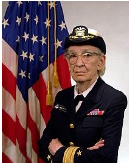
GRACE MURRAY HOPPER - DECEMBER 9, 1906 – JANUARY 1, 1992

During the 2 nd week in December, students are encouraged to take part in an "Hour of Code", during which, students are literally expected to code for an hour. Along with coding, CSEd Week highlights the importance of computer science. Computer science is an important subject because it teaches problem-solving and analytical skills, and is an essential skill in the modern job market. The day hopes to improve computer literacy among all.