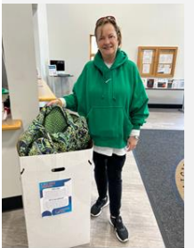
Tote bags to Community Cares