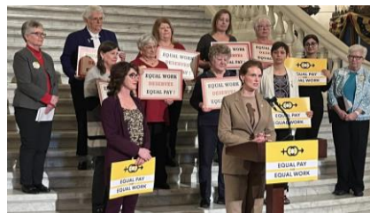
Rep. Abigail Salisbury at podium