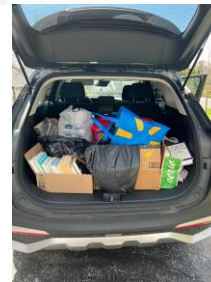
Oodles of Books donated at 75 th Birthday Party!