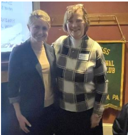
First Lady Aronson