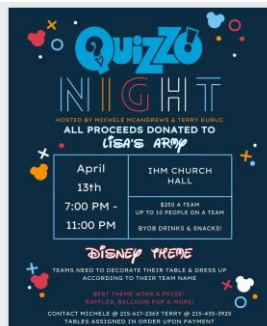
DISNEY THEME QUIZZO NIGHT AT IMH CHURCH HALL- APRIL 13 TH

Stop into some of your favorite businesses on April 6 th to meet many of the amazing local Authors at The Discover Conshohocken Borough Wide Book Signing!