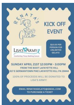
RENATA'S GELATO KICK OFF EVENT FOR LISA'S ARMY– APRIL 21 ST

All proceeds benefit Lisa's Army , comforting those battling cancer.