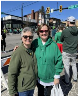
CONSHOHOCKEN ST. PATRICK'S DAY PARADE – MARCH 16 TH