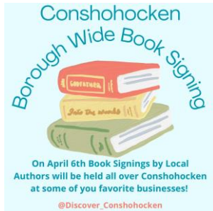
CONSHOHOCKEN BOROUGH BOOK SIGNING – APRIL 6 TH

Stop into some of your favorite businesses on April 6 th to meet many of the amazing local Authors at The Discover Conshohocken Borough Wide Book Signing!