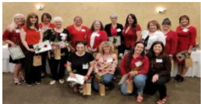
New Member Installation – May 18, 2023