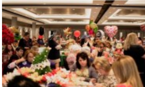
18 th Annual Spring Tea – April 1, 2023

We will take a break from our regular monthly dinner meeting in July and will instead hold our crossover meeting on July 20 th for new club year. We will be welcoming several new committee chairs and co-chairs and look forward to making plans for state project fundraising, guest speakers and special events including our club's 95 th anniversary party in 2024.